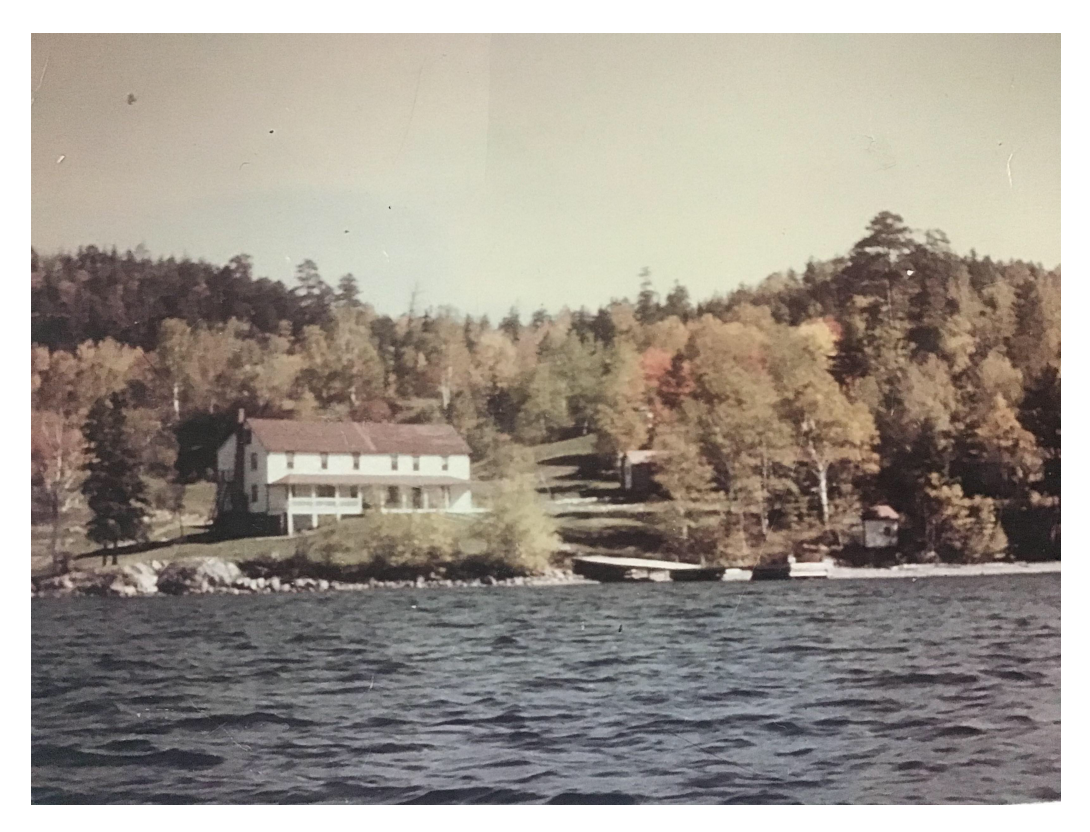
Figure 2: Friday Family Camp on Naadgaaming. "Where many visited and stayed; whether planned, or not" (V. Friday, personal communication, 23 February 2021).

Point, it's the whole territory, which includes about a dozen lakes" (V. Friday, personal communication, 23 February 2021). Over the next several decades, the Fridays built a family lodge and tourist camp (Figure 2), on what would become known as Naadgaaming. The Friday family business included overnight lodging, guided trapping, and hunting tours.