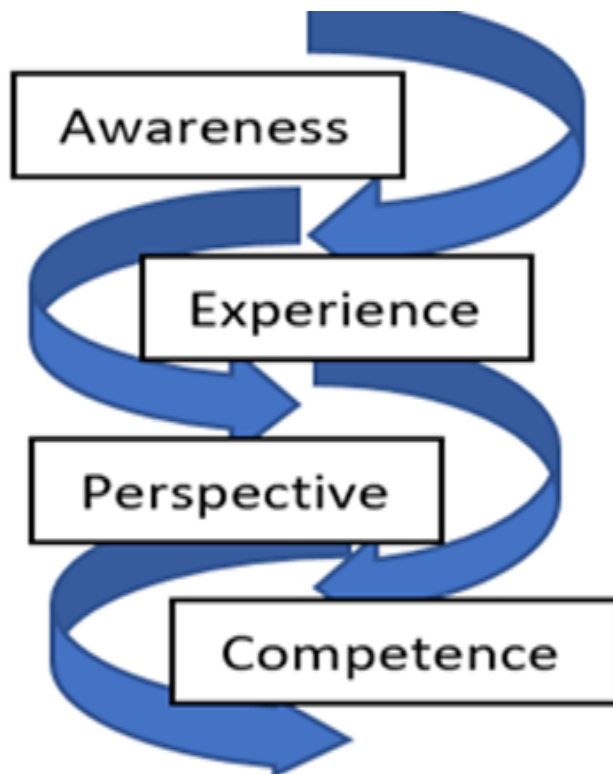
Figure 3. Global learning model for practicum instruction

These conclusions derived from the Guatemala practicum research suggest the need for the adoption of a global learning model for practicum instruction, as depicted in Figure 2, which in turn enables SaP approaches. In this interactive model, the four stages of awareness, experience, perspective, and competence create feedback loops with each other. Awareness starts in pre-departure and expands through the practicum experience. The direct experience students have is acquired in the work they develop with the agency partners in their practicum placements and during any other community field work. Their perspective changes as the practicum experience evolves. Their competence increases as they are able to assess the accomplishment of their learning outcomes, set prior to conducting the practicum experience.