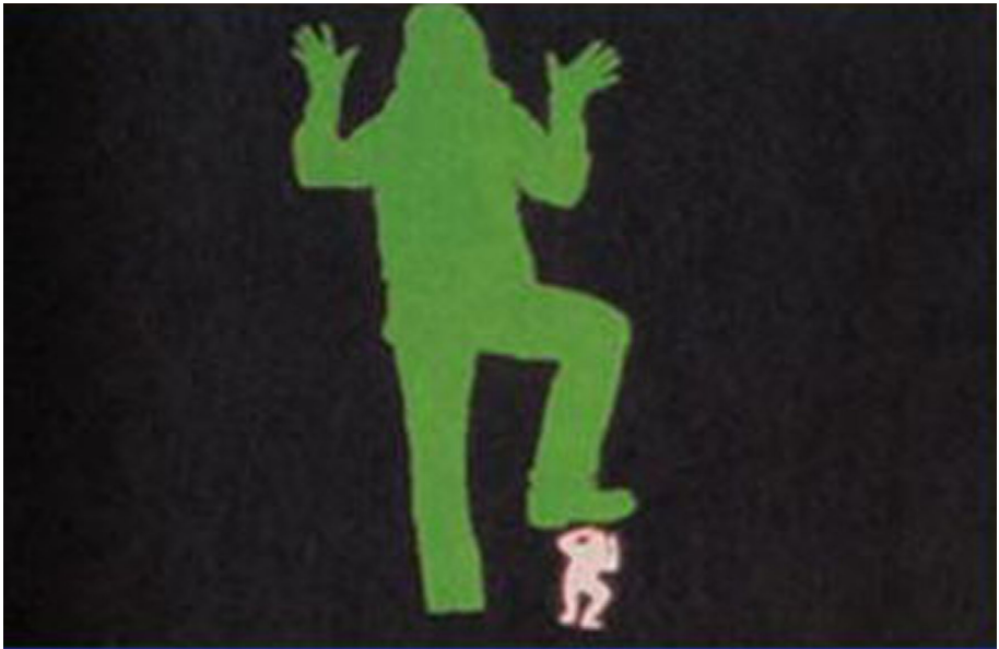
Figure 1: Myron Krueger, "Videoplace", Golden Nica Prix Ars Electronica 1990 "Interactive Art."

Another key figure in this evolution of art and technology research is computer-scientist and inventor Myron Krueger. Krueger famously developed computer systems and camera-based capture devices to create "Responsive Environments." These systems allowed a person's shadow to be captured, reduced to a single colour outline and then transported into the computer world where he or she would then interact with computer-based creatures and objects. Krueger wrote that "man-machine interaction is usually limited to a seated man poking at a machine with his fingers...I was dissatisfied with such a restricted dialogue and embarked on research exploring more interesting ways for men and machines to relate" (Krueger, 1977, pp. 105-6). Krueger developed many responsive environment technologies that evolved and eventually led to his most well-known work, Videoplace .