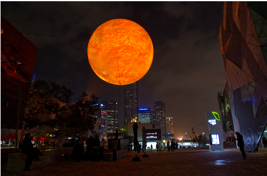
Figure 2: Rafael Lozano-Hemmer, “Solar Equation, Relational Architecture 16”, 2010. Used by permission

“Solar Equation” is a large-scale public art installation that consists of a faithful simulation of the Sun, 100 million times smaller than the real thing. Commissioned by the Light in Winter Festival in Melbourne, the piece features the world’s largest spherical balloon, custom-manufactured for the project, which is tethered over Federation Square and animated using five projectors. The solar animation on the balloon is generated by live mathematical equations that simulate the turbulence, flares and sunspots that can be seen on the surface of the Sun. This produces a constantly changing display that never repeats itself, giving viewers a glimpse of the majestic phenomena that are observable at the solar surface and that only relatively recent advances in astronomy have discovered. The project uses the latest SOHO and SDO solar observatory imaging available from NASA, overlaid with live animations derived from Navier-Stokes, reaction diffusion, perlin, particle systems and fractal flame equations. (Lozano-Hemmer, 2010)