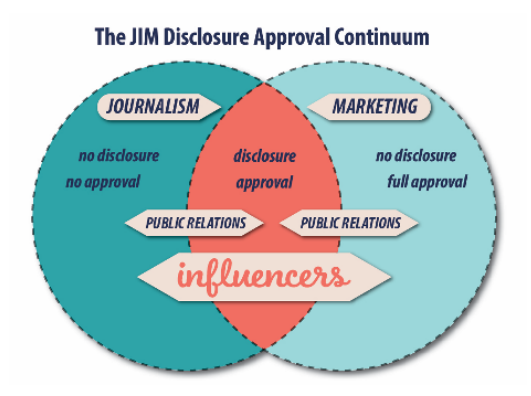
Exhibit 3: The JIM Disclosure Approval Continuum

In brief, this model illustrates that the realm of journalism requires that journalistic independence. They do no need to disclose payment as they should not accept any. They also do not require approval to share their findings, they are guided by the public interest and fact. In the influencer realm, influencers practice "brand journalism" which is disclosed to their audience and approved of by the brand. Finally, marketers do not disclosure sources of information, but they control the message through full approval. Public Relations therefore becomes a bridge (brand to influencers) and a buffer (journalists to brand).