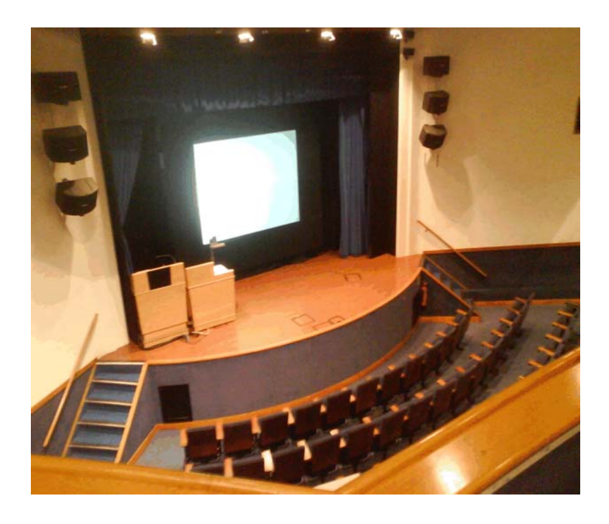
Figure 3. The Old Theatre today.