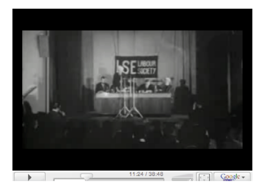
Figure 1. A still from the film.